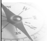
Chart Your Course!

Adult Leisure Courses Aquatic Center Adult High School After School Camps Community Non-Profit Focus